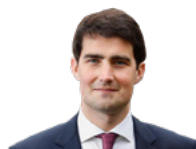
Minister of State for Sport and the Gaeltacht Jack Chambers TD